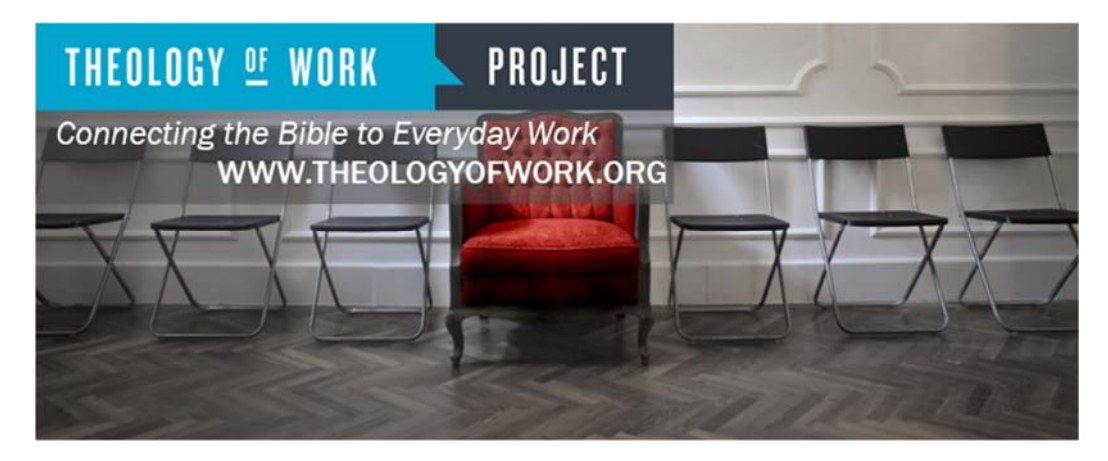
WEEK 4: MAKING ROOM FOR OTHERS

The first two years of my time at university were spent living at Knox College — an allmale Presbyterian hall of residence in Dunedin. Knox was modelled on the college system of the great British universities and purported to offer much more than that of a hostel, which is why most students stayed there for multiple years of their university careers. Tutorials, chapel services, cultural and sporting events — these were all features of Knox life.